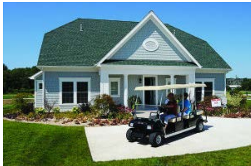
Don Campbell / H-P staff